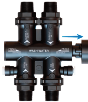
Unit in Bypass mode

To bypass: Push the plunger fully in the direction shown.