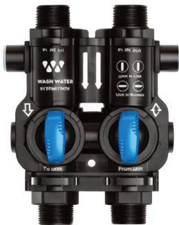
Unit in use