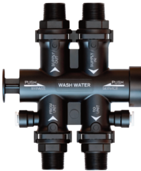
Unit in use