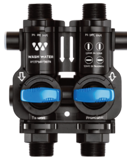
Unit in Bypass mode

To bypass: Turn both handles 90° as shown