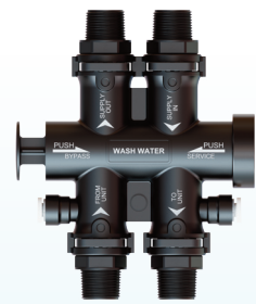
EaSi-Fit Bypass – up to 80 lpm. Supplied with speedfit connections for both 15 and 22mm pipework.